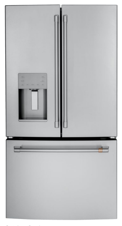
Stainless Steel with Brushed Stainless handles