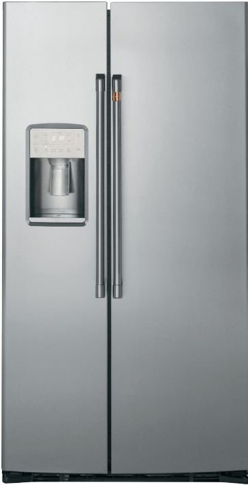
CZS22MP2NS1 Stainless steel with Brushed Stainless handles